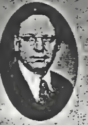
W. McIntyre Life Insurance